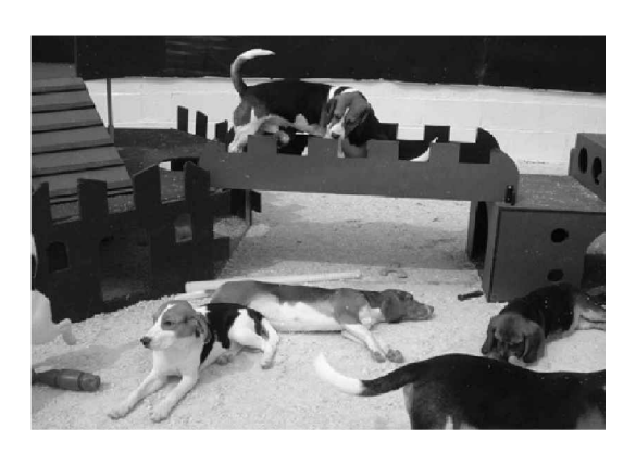
Fig 11 An outdoor exercise/activity area with enrichment equipment (wooden tunnels, platforms and ramps, plastic toys, and chews)

An animal care person should be present with the dogs at all times during the exercise sessions for three main reasons: