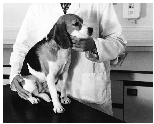
Fig 15 Dogs should be trained to tolerate restraint with positive reinforcement techniques

Temporary restraint is known to be potentially stressful to dogs (Knol 1989) but habituation and training can reduce the associated stress. If restraint is necessary to control a dog during a scientific procedure, then the method used should provide the least restraint required to allow the procedure to be performed properly (Fig 15: Animal Welfare Institute). It should protect both dogs and personnel from harm and should avoid causing distress or unnecessary discomfort (National Research Council 1994). The duration of restraint should always be minimized. Minor procedures, such as taking a rectal temperature or administering a subcutaneous injection can usually be accomplished by using minimal restraint. During venepuncture, sufficient restraint and accuracy should be used to avoid repeated needle insertions and to prevent the development of painful haematomas.