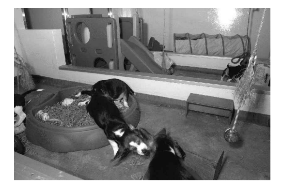
Fig 12 An indoor exercise/activity area with suspended toys, a plastic tunnel and a sandpit filled with soft shredded bedding (Enviro-dri®) and toys