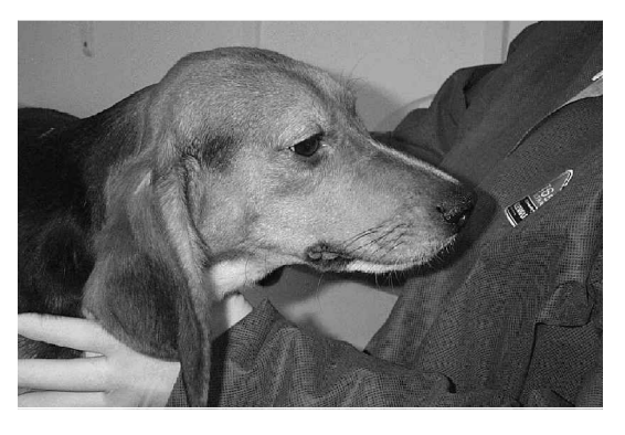
Fig 5 This head posture with lowered ears and concentrated facial expression is often accompanied by lip smacking and is indicative of an anxious emotional state