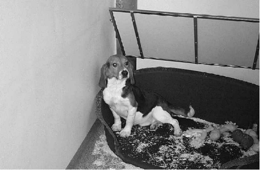
Fig 8 Fearful dogs may retreat from people entering the home pen and attempt to get into the corner of the pen or under the platform

a behaviour which is generally viewed as a sign of 'happiness' and well-being in the dog. However, tail wagging alone does not give any indication of motivation and it is dangerous to always interpret a wagging tail as a friendly gesture. Instead it should be interpreted alongside other communication signals, and factors such as the height of tail as it is wagged should also be taken into consideration. A medium tail carriage in conjunction with steady wagging and confident approach is interpreted as a general expression of friendly greeting (Fig 4D), while a tail held high and waving steadily along its length indicates confident interaction and may even be used as part of a threat display. A tail held in a low position