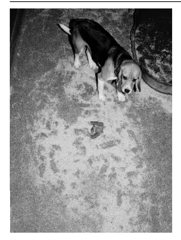
Fig 9 Sawdust on floor showing pattern of circling stereotypy—this is a cause for concern and the housing design and management practices should be re-assessed. Stereotypies might not always be the product of current housing, as once established they can be hard to eradicate

17.7) or rehomed (see Section 19). In addition to the ongoing poor welfare of the individual, the use of such animals in some areas of research and testing may skew scientific data.