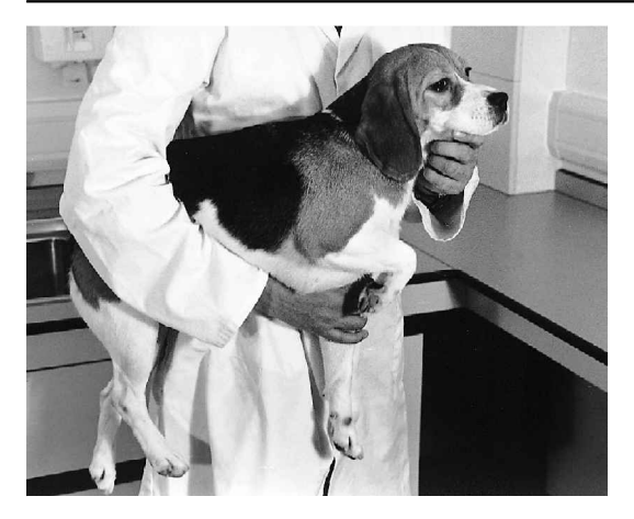
Fig 14 When carried, dogs should be safely restrained and have their body weight supported

Direct eye contact and potentially threatening body postures must be avoided. When dogs are carried, they should be safely restrained and their body weight should be supported (Fig 14: Animal Welfare Institute); 'scruffing' should not be used for carrying or for lifting dogs from the floor or tables. In the procedure room, staff demeanour should be calm, confident and quiet. Dogs can be stroked while on the examination table but care should be taken not to unintentionally reinforce fearful responses in this way.