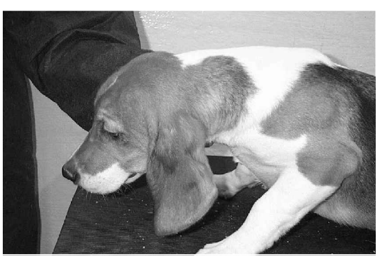
Fig 7 A fearful dog with a lowered head posture and stiffened forelimbs avoids eye contact with the handler