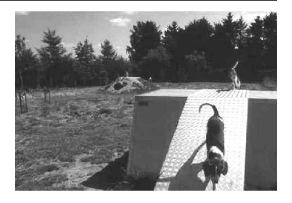
Fig 13 An outdoor exercise/activity area at Novo Nordisk, Denmark. Dogs have access to this 2000 m<sup>2</sup> space with enrichment equipment, mounds and trees five times a week for a minimum of 1–2 h daily

It is frequently overlooked that dogs are very exploratory animals whose world is dominated by smell and not sight. Provision of an outdoor exercise/activity area will enable exploration and a wider range of normal behaviours. It will help facilities to more easily meet some of the fundamental behavioural needs of dogs, particularly relating to olfaction (e.g. nosing, ground and air