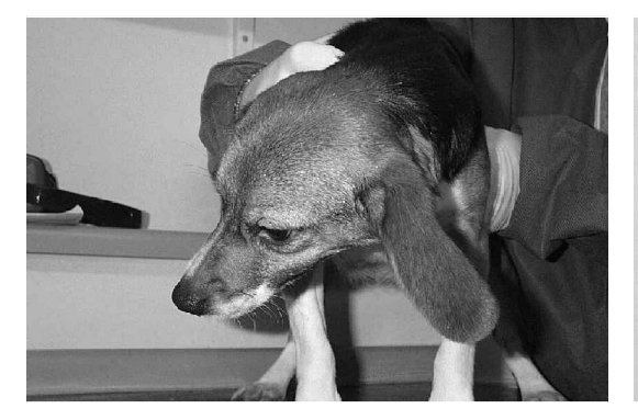
Fig 6 Fearful dogs may attempt to avoid eye contact. This facial expression is accompanied by a stiffened body posture, which can make it difficult to place the dog in a sitting position on the table

a behaviour which is generally viewed as a sign of 'happiness' and well-being in the dog. However, tail wagging alone does not give any indication of motivation and it is dangerous to always interpret a wagging tail as a friendly gesture. Instead it should be interpreted alongside other communication signals, and factors such as the height of tail as it is wagged should also be taken into consideration. A medium tail carriage in conjunction with steady wagging and confident approach is interpreted as a general expression of friendly greeting (Fig 4D), while a tail held high and waving steadily along its length indicates confident interaction and may even be used as part of a threat display. A tail held in a low position