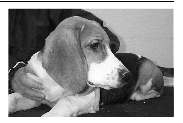
Fig 2 An alert facial expression with ears carried high and forward is indicative of a relaxed emotional state

Olfaction, one of the most important means of communication in the dog is, unfortunately, the sense that humans have most difficulty comprehending. Visual signals (i.e. body postures and facial expressions) and vocalizations will therefore be the most important signals in terms of human-dog interactions. These methods of communication provide an indication of a dog's emotional state and can provide information about the relative social status of dogs within the same social group. They can also provide information about the dog's intended action in response to a situation or interaction, and accurate interpretation is instrumental in minimizing pain and distress. For example, a relaxed dog will show an alert facial expression with ears carried high and forward (Fig 2), whereas a dog that adopts a low posture with head and ears held low is indicating a lack of selfconfidence (Fig 3). Such an individual may require extra habituation to a procedure or more specific training in order to minimize its fear responses. It may be instinctive for staff to offer reassurance to these individuals, but care must be taken not to inadvertently reinforce fear in this way.