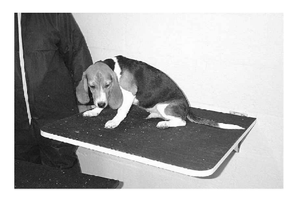
Fig 3 A crouched body posture and lowered head is indicative of a fearful emotional state. The dog is also showing anticipation of getting off the table

During social interactions with conspecifics and humans, dogs will frequently use communication signals to test the response of the receiver and will