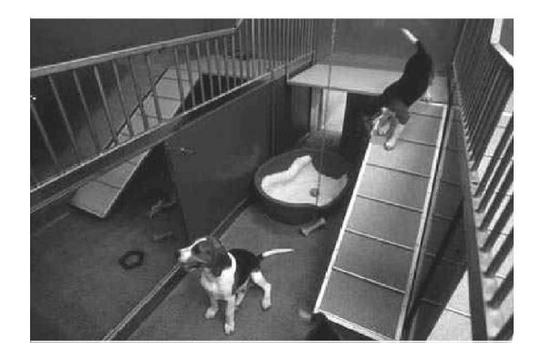
Fig 10 Dog pens designed to meet the behavioural needs of the dog. The pens are linked in pairs with access to an outdoor area through the pop-hole at the back of the pen. Pen subdivisions allow complexity and choice. Raised platforms offer visibility across the room. Suspended chews are provided as means of environmental enrichment. A dog bed with fleecy bedding offers a comfortable resting place

Groups of pens within a room should be arranged in such a way that it is possible to move dogs to another pen temporarily during wet cleaning, so as to avoid exposing the occupant(s) to buckets of water, highpressure hoses or other aversive stimuli (see Section 9).