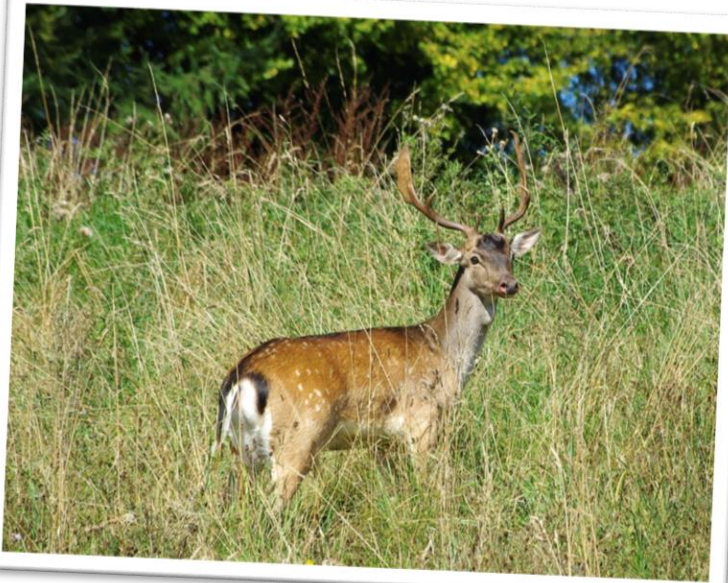
Male fallow deer

Once captive, deer are also protected under the Animal Welfare Act 2006 and the release of any non-native deer species into the wild is an offence under the Wildlife and Countryside Act 1981 or Invasive Alien Species regulations .