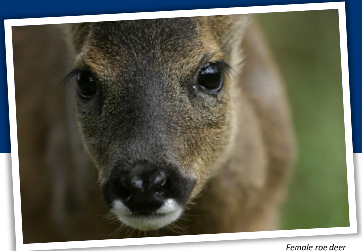
Female roe deer

In the pre-rut period, male deer will start sparring using their antlers in shows of strength. However, during the rut this behaviour escalates into elaborate displays for dominance over breeding rights. These competitive bouts vary between species but will commonly involve roaring, grunting, parallel walks and if all else fails, fighting. During the fights many males suffer serious injuries, inflicted by their opponents' antlers, and fatal wounds are not uncommon. Following the rut, antlers are usually shed and re-grown before the next rut.