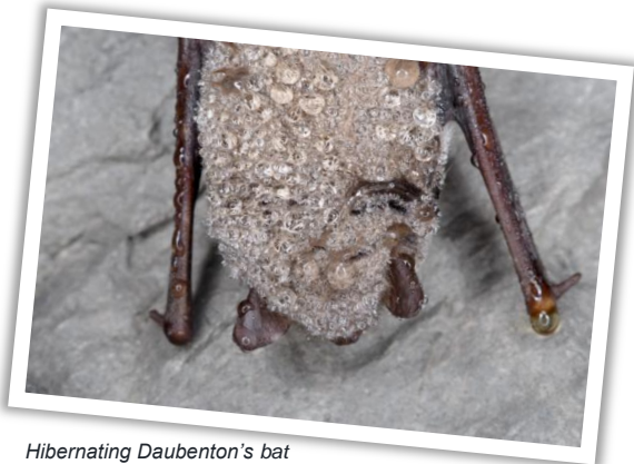
Hibernating Daubenton's bat

If you need to have work done on a property with a bat roost, or you have a rodent or insect problem at the bat roost, you will need to make sure you are proceeding lawfully. You should therefore contact the Bat Conservation Trust (BCT) and Natural England or Natural Resources Wales (as appropriate) for advice and guidance well in advance of the work starting.