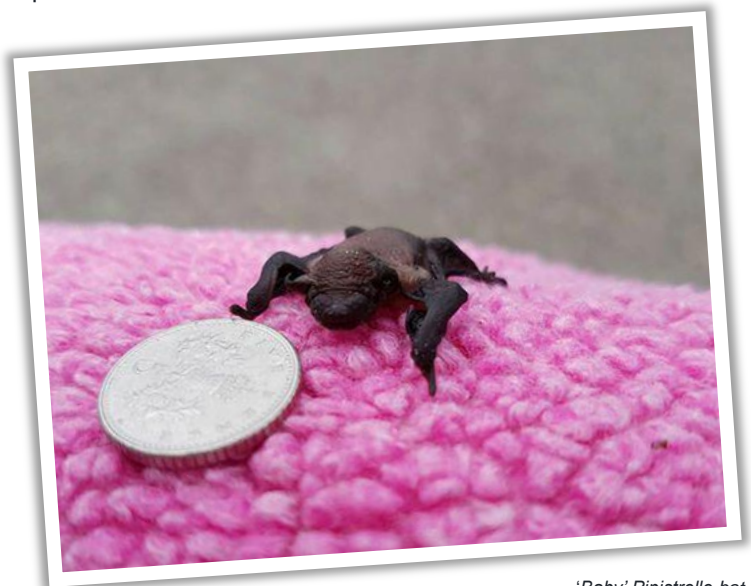
'Baby' Pipistrelle bat

If you have found a bat which is pink/hairless, no larger than a 50p coin and has its eyes closed, you have found a bat pup. Juveniles will have open eyes, be a little larger and have short, velvety-grey fur. It is very urgent that bat pups and young juveniles receive specialist care as soon as possible so please contact either the BCT or the RSPCA (see below) as soon as possible for assistance.