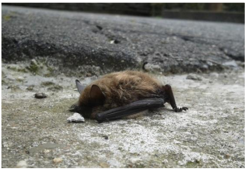
Whiskered bat - grounded