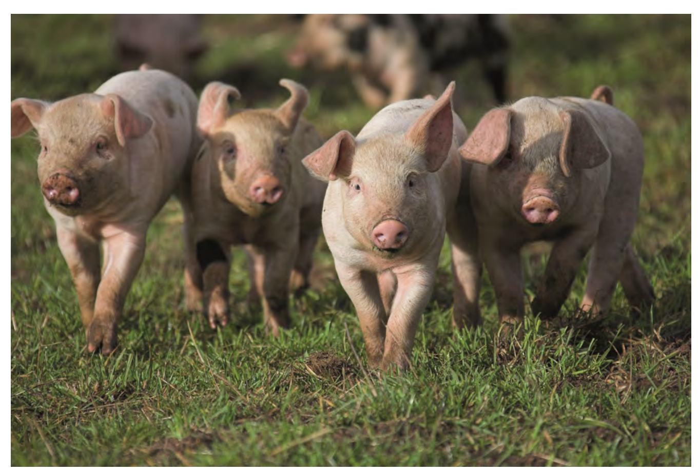
Funding could be available to provide extra space or enrichment for pigs.

In the 2014–2020 period, 29 RDPS contained these measures with two further RDPs looking to join. This accounts for 1.4 percent of total rural development expenditure. A selection of these that could be used in the UK where relevant are given on page 10. Examples of actions allowed under the programmes are given on page 11. Specific examples of where and how the funding is being used is given in Table 2.