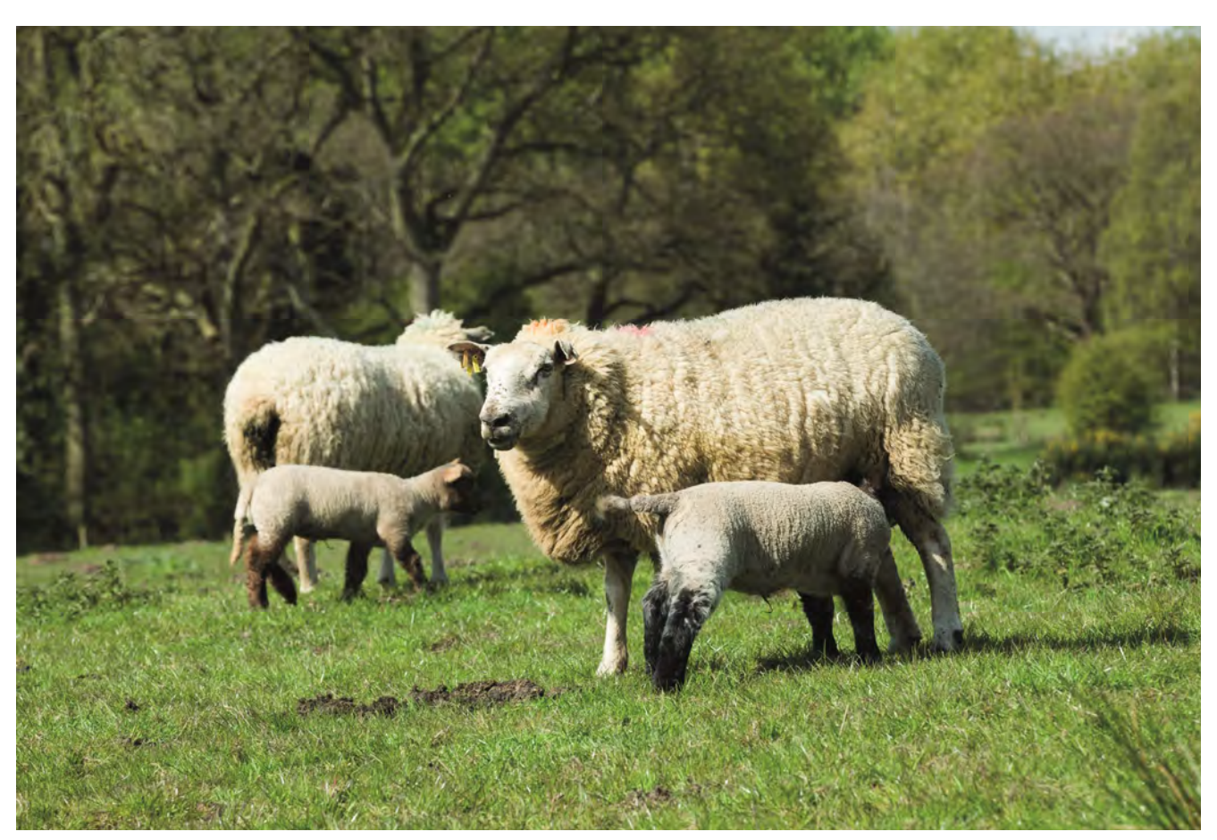
Funding could be available to improve health and welfare in sheep.