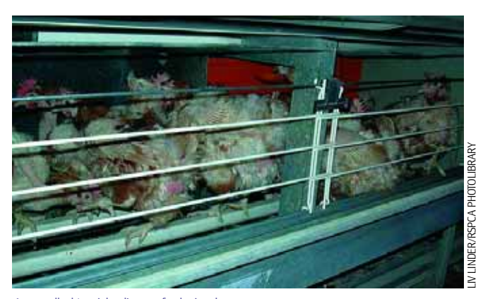
A so-called 'enriched' cage for laying hens.

Most free-range hens live in buildings similar to the barn system, allowing them to perform natural behaviours and move freely around the unit. In addition, the hens have access to an outside range area.