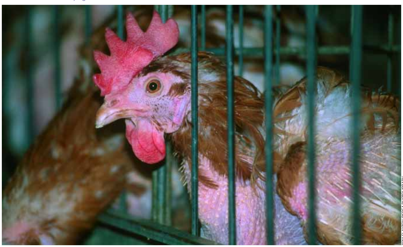
A hen in a conventional battery cage.

In light of this research and with the impending review of the EU Directive, the RSPCA is urging the UK government to ban all cage systems by 2012.