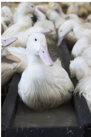
Pekin duck bathing in an open water facility.

We are concerned that commercial duck production may be heading in the direction of increasing the rate of growth of ducks beyond a level that is acceptable to welfare. For example, meat ducks can have difficulty walking and be subject to leg problems 10 . In a recently published scientific paper, 13% of commercial ducks assessed had moderate, and 1.2% had severe, gait (leg) problems.