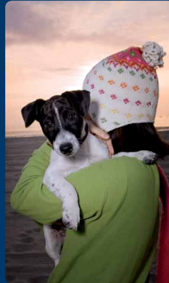
BRAND X/JUPITERIMAGES.CO.UK / POSED BY MODEL

We also provide much-needed advice and information to hundreds of callers every month.