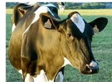
Surrogate mother carries growing embryo