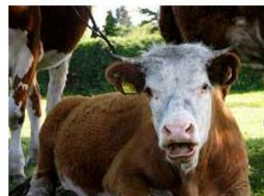
Cloned offspring born