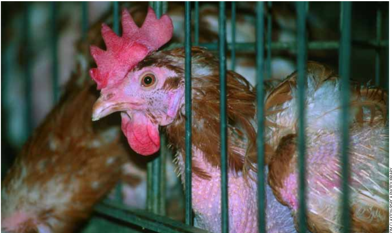
A hen in a conventional battery cage.

In light of this research and with the impending review of the EU Directive, the RSPCA is urging the UK government to ban all cage systems by 2012.