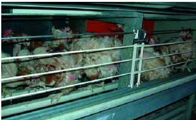
A so-called 'enriched' cage for laying hens.

Most free-range hens live in buildings similar to the barn system, allowing them to perform natural behaviours and move freely around the unit. In addition, the hens have access to an outside range area.