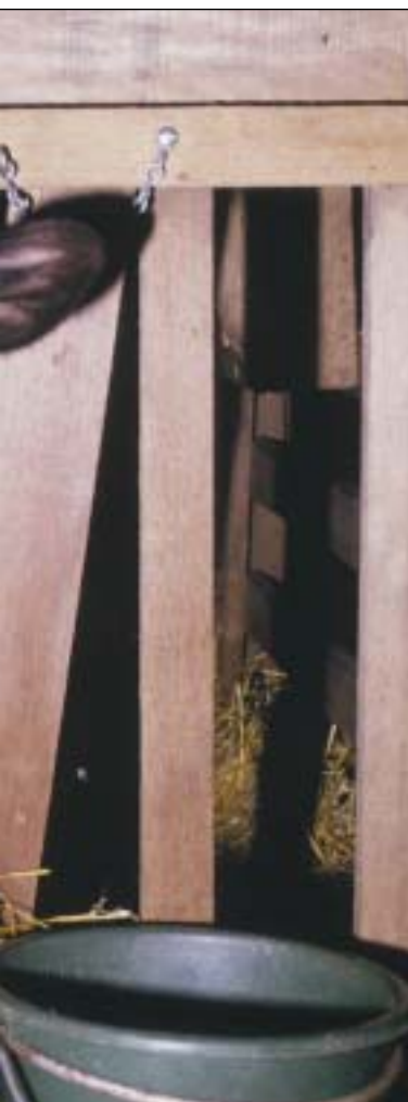
Some intensive livestock systems, such as the veal crate, are being phased out in the EU in favour of more extensive systems (right).

Farm animal welfare is of fundamental importance to the future of the whole farming and food sector. There are often close links between improving animal health and welfare and the environment as well as responding to consumer and producer wishes and needs. For example, frequent journeys over unnecessarily long distance adversely affect animal health and welfare, the environment, and costs to consumers. Animal and consumer health, and the financial viability of producers, can be put at risk by poor on-farm living conditions. The 2002 review must respond to this omission and re-position animal welfare as an important issue in the CAP.