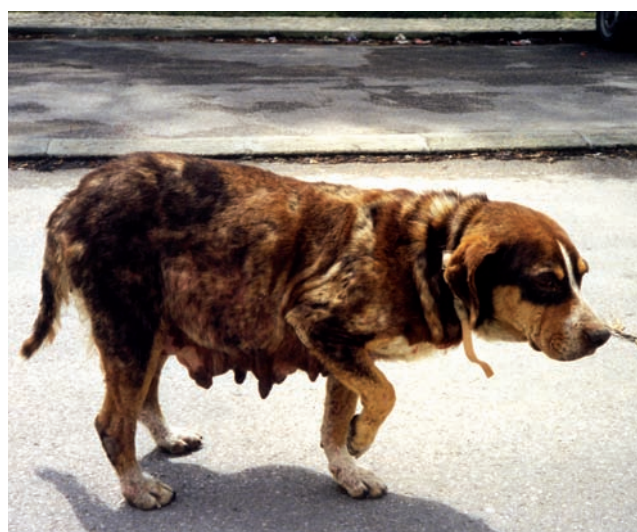
Owned roaming dog in Portugal.

There will be welfare issues relating to both restricted and roaming dogs. However, for the purposes of this document, the aim of dog population management is defined as: “To manage roaming dog populations and the risks these may present, including population size reduction when this is considered necessary”.