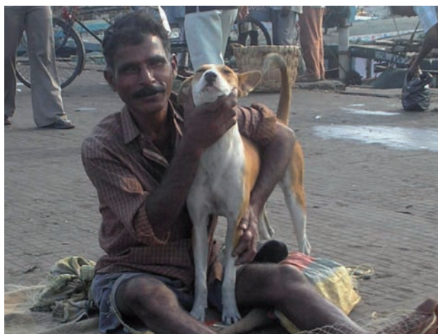
Fisherman and community dog in India.