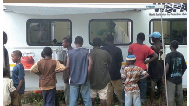
Local people watching surgical sterilisation through windows of mobile clinic on Zanzibar.

In 2006, there was a similar situation in Zanzibar when WSPA and the local government introduced a sterilisation intervention. It started with low compliance, with few owners willing to bring their animals for sterilisation. However, over a period of months, the education programme, discussions with key community leaders and actual examples of healthy sterilised animals began to create a change in human attitudes, leading people to actively bring their animals to be sterilised.