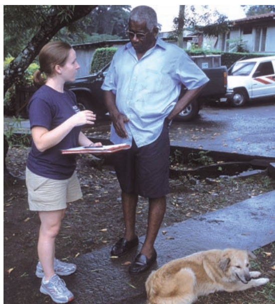
Pet owner survey in Dominica.

Attitudes and beliefs behind such behaviours may be hard to measure quantifiably (using a numerical regular scale). Discussions or open-format interviews with groups of people with relevant experience (such as dog owners or animal health workers) can help to bring out opinions. Keep these groups small and informal and allow free discussion around topics, using prompting questions to guide the discussion.