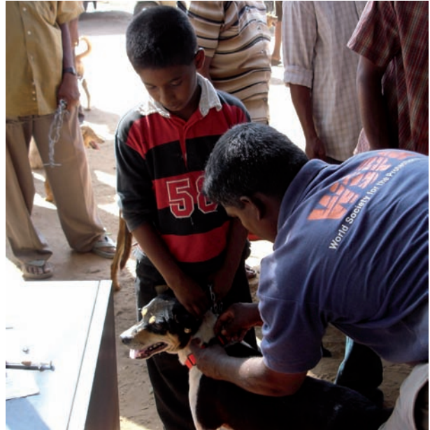
WSPAV / BLUE PAW TRUST