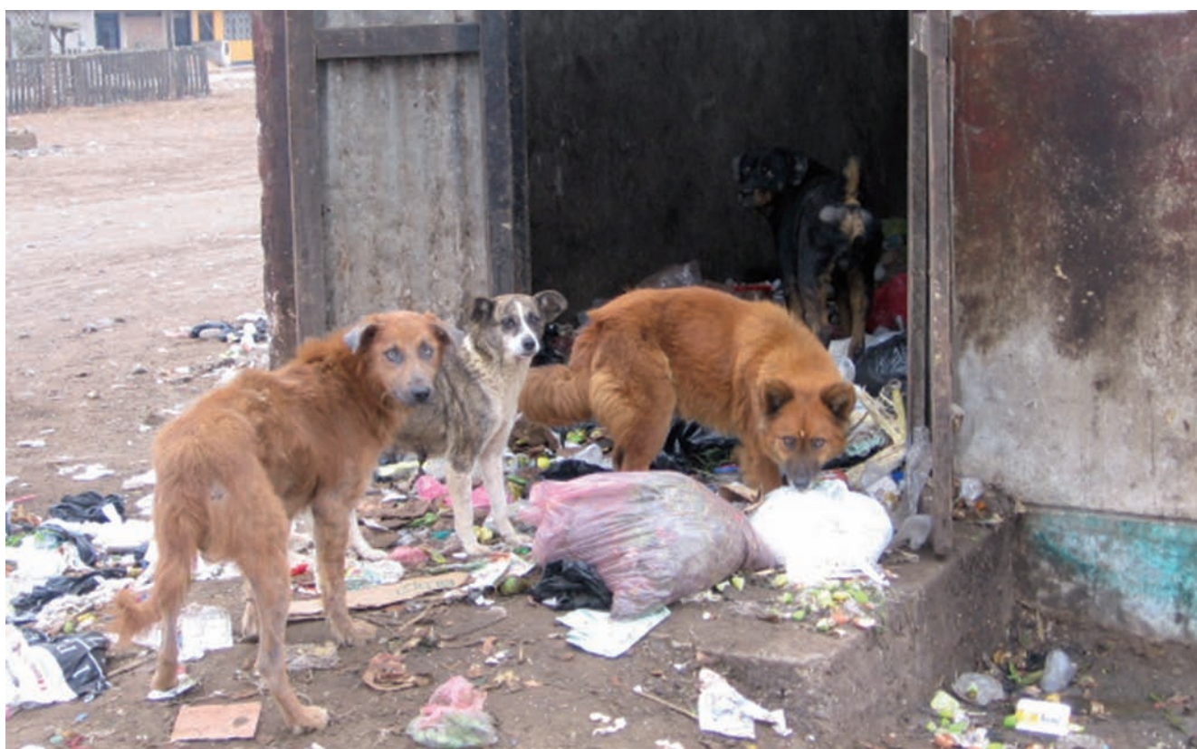
Roaming dogs feeding from rubbish in Peru